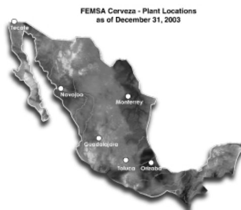
FEMSA Cerveza Facility Capacity Summary (Thousands of Hectoliters) Year Ended December 31, 2003

FEMSA Cerveza currently operates six breweries with an aggregate monthly production capacity of 2,708 thousand hectoliters, equivalent to approximately 32.5 million hectoliters of annual capacity. Each of FEMSA Cerveza’s breweries has received ISO 9002 certification and a Clean Industry Certification ( Industria Limpia ) given by Mexican environmental authorities. A key consideration in the selection of a site for a brewery is its proximity to potential markets, as the cost of transportation is a critical component of the overall cost of beer to the consumer. FEMSA Cerveza’s breweries are strategically located across the country to better serve FEMSA Cerveza’s distribution system.