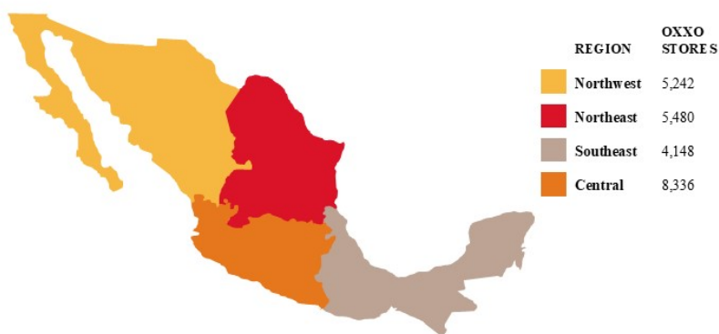
OXXO Stores Regional Allocation in Mexico

In addition to expanding into the U.S. market, the Proximity Americas Division expanded its operations by opening 1,596 new OXXO stores in Mexico, Colombia and Peru during 2024, partially offset by 108 net closures in Chile. Additionally, as of December 31, 2024, Grupo N6s operated 594 OXXO stores and 1,244 Shell Select locations in Brazil, and managed 22 Shell Select stores operated by independent franchisees. Grupo N6s expanded its operations by opening 154 OXXO Stores in Brazil during 2024.