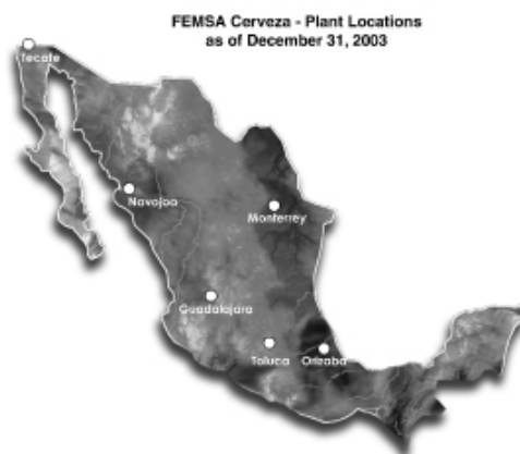
FEMSA Cerveza Facility Capacity Summary (Thousands of Hectoliters) Year Ended December 31, 2003

FEMSA Cerveza currently operates six breweries with an aggregate monthly production capacity of 2,708 thousand hectoliters, equivalent to approximately 32.5 million hectoliters of annual capacity. Each of FEMSA Cerveza’s breweries has received ISO 9002 certification and a Clean Industry Certification ( Industria Limpia ) given by Mexican environmental authorities. A key consideration in the selection of a site for a brewery is its proximity to potential markets, as the cost of transportation is a critical component of the overall cost of beer to the consumer. FEMSA Cerveza’s breweries are strategically located across the country to better serve FEMSA Cerveza’s distribution system.